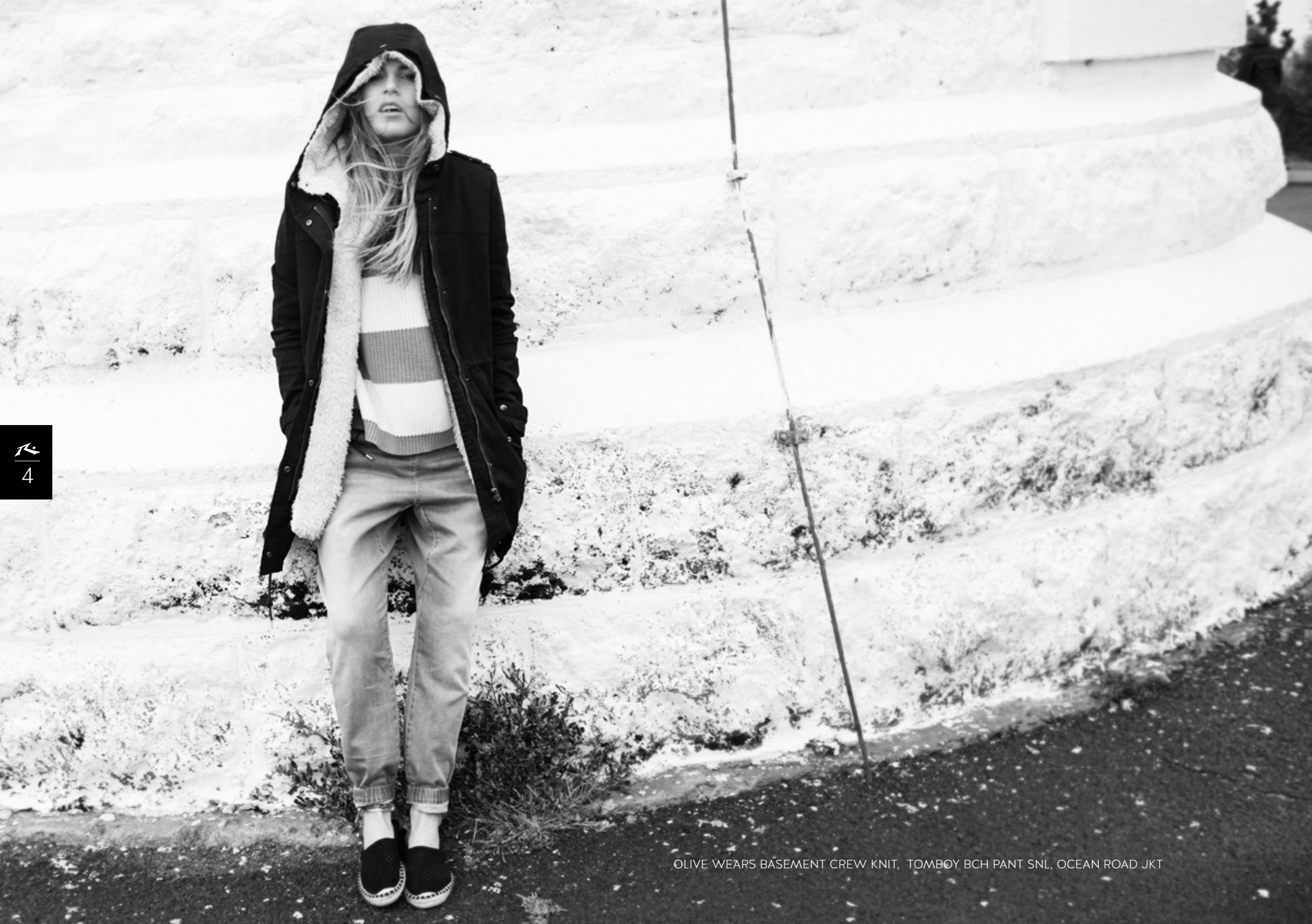
OLIVE WEARS BASEMENT CREW KNIT, TOMBOY BCH PANT SNL, OCEAN ROAD JKT