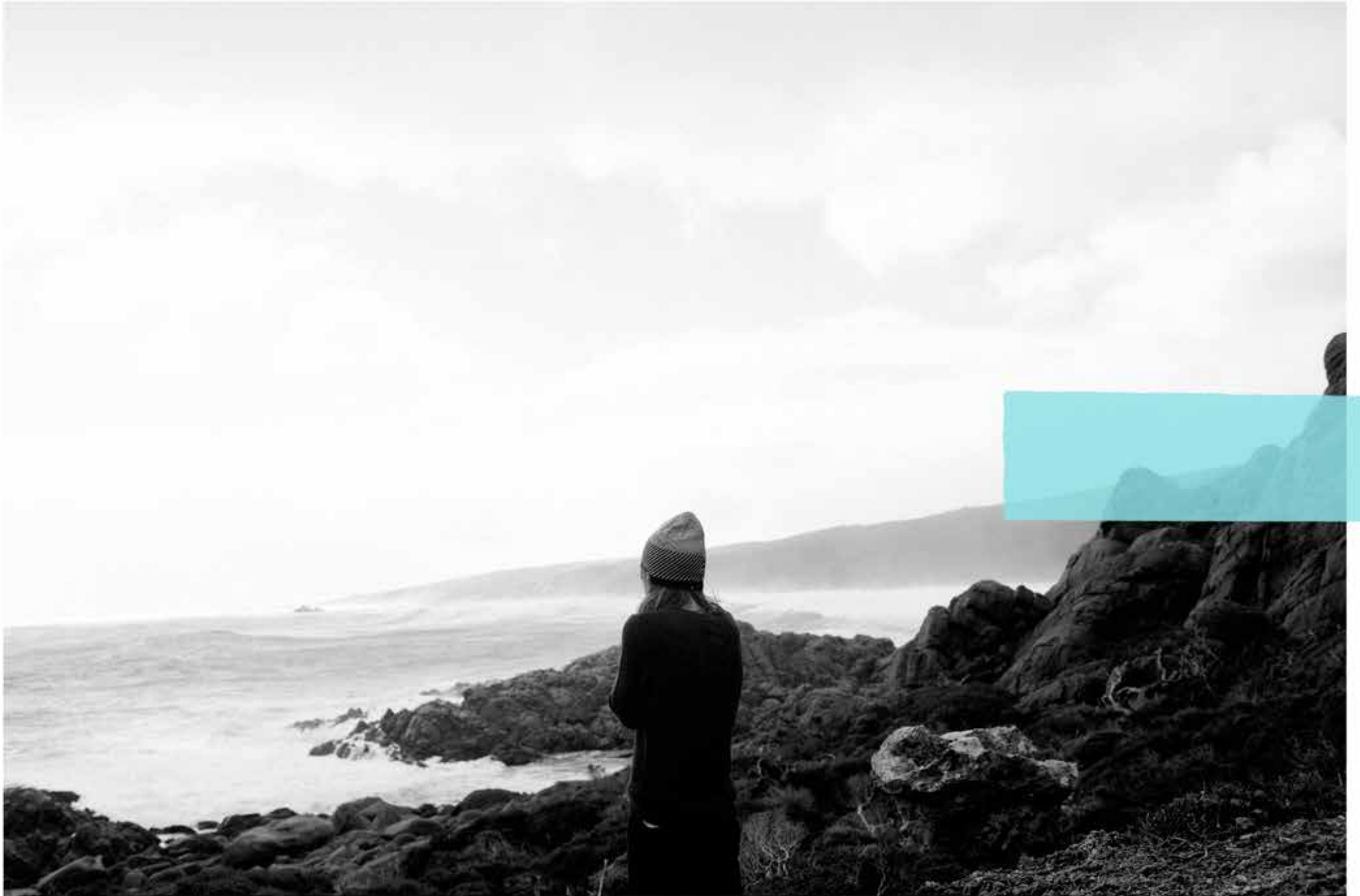
OLIVE WEARS DEVINE CREW KNIT